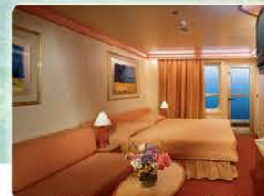
SUITES WITH BALCONY Call for prices and availability of all suites.