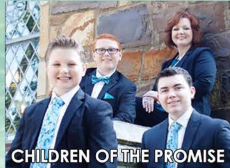
CHILDREN OF THE PROMISE