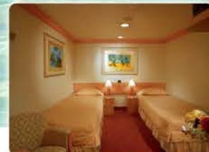
INTERIOR STATEROOM 4B - Riviera Deck $795 4C - Main Deck $815 4D - Upper Deck $845

Special pre-cruise hotel accommodations are also available in Mobile, AL. Complete details will be listed on your cruise receipt, or you can call Sandy at Interworld Travel at 1-800-993-8785, or you can also visit our website, www.gospeljubileecruise.com for all the information on hotels, booking, groups, etc. Get ready to have the time of your life on the Gospel Jubilee Cruise!