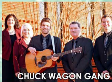
CHUCK WAGON GANG