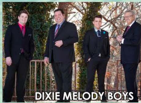
DIXIE MELODY BOYS