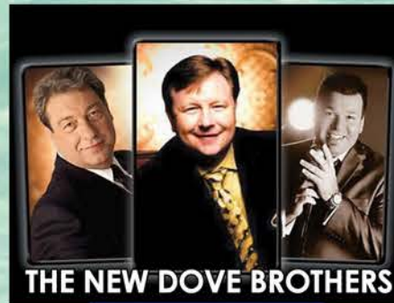
THE NEW DOVE BROTHERS