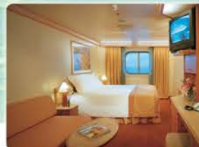
OCEANVIEW STATEROOM 6B - Riviera Deck $865 6C - Main Deck $895 6D - Upper Deck $935 6E - Empress Deck $965